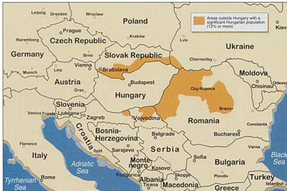
Figure 1: Regions with significant Hungarian population 1

According to census data, there are approximately 1.4 million ethnic Hungarians living in Romania and 520,000 in Slovakia, with smaller groups in Ukraine, Serbia, Croatia, Austria, and Slovenia. In Slovakia and Romania, Hungarians make up the single largest ethnic minority group in each country, representing ~10% of the total population in Slovakia and 6.6% of the population of Romania 2 . As can be seen in Figure 1, these ethnic Hungarians live primarily in regions along the Hungarian border, although in Romania there are regions with significant Hungarian presence well into the center of the country, such as Transylvania. The heavy concentration of ethnic Hungarians in these regions means that there are some towns and governmental districts in which this ethnic minority actually becomes the local majority, with ethnic Hungarian populations higher than 50%. The existence of ethnic Hungarians as both a substantive percentage of their neighboring countries' populations and the existence of regions in which ethnic Hungarians represent a higher than average (or even majority) percentage of the local population combine to make the ethnic Hungarian minorities one of the most vocal and politically active minority groups within Slovakia and Romania.