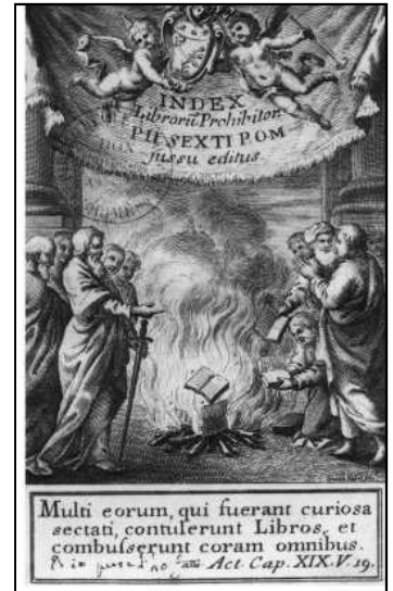
Frontispiece of the Index Prohibitorum Librorum , 1786