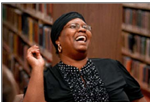
Naylor laughed during an interview on campus.

Gloria Naylor has been working on that song for 35 years now. She has called New York City home all her life – in fact, she has lived in every borough but Staten Island – but now she hopes to sell her Brooklyn brownstone and move to Paris. As part of making a new life for herself, she recently completed the donation of her personal and professional archives to Sacred Heart University. They will reside in a specially designated room in the Ryan-Matura Library and will be available for student use and scholarly research.