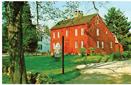
The Darien Historical Society

The Gilder Lehrman History Scholars Program is a competitive summer scholarship program in American history for outstanding college sophomores and juniors. The program, based in New York City, has been designed to both reward undergraduates who have demonstrated superb research and writing skills in the field of American history. The 2007 Gilder Lehrman History Scholars Program will run from June 24-July 28. For details on how to apply see www.gilderlehrman.org/teachers/student2.html .