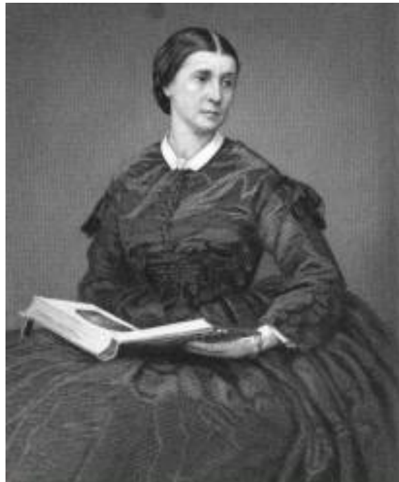
Rose O'Neal Greenhow

elitist, and a snob. Clever, beautiful, articulate, and outspoken”. 18 She will always be remembered as the woman who alerted the rebels of enemy plans in 1861, which led to the Battle of Manassas. She is also the woman who ran a successful spy ring in the middle of Washington, D.C. However, you will not read about her in history textbooks or most studies. Greenhow is one of the many unsung heroes of the Civil War, in addition to the other female spies in the Union and Confederacy.