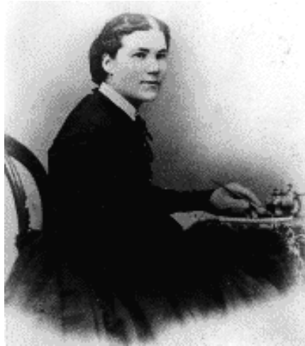
Sarah Emma Edmonds

the defense of the right’’. 30 Through what she experienced and how she changed her life, Edmonds was able to make an impact on the War.