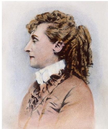
Elizabeth Van Lew

Van Lew operated a successful spy ring that gave her the recognition she has today. She was able to succeed because “her social position and gender served as her most convincing disguise. No one would believe that a frail, pampered spinster was capable of plotting treasonous acts, let alone carrying them out right under the government’s nose.” 35 Most were not too surprised when Van Lew denied invites to help sew rebel uniforms, or when she openly opposed the institution of slavery, because she never kept her loyalty to the Union a secret. While it sometimes made them suspicious, there was not much done on their questioning, and that is how Van Lew was able to achieve what she did.