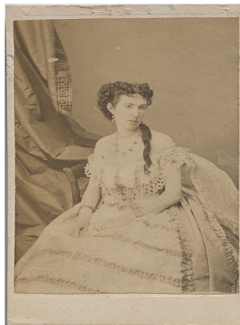
Belle Boyd, ca. 1864