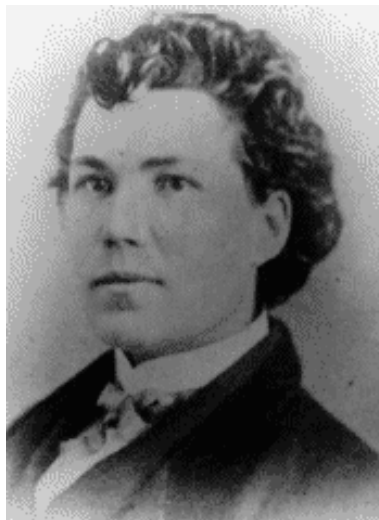
Franklin Flint Thompson