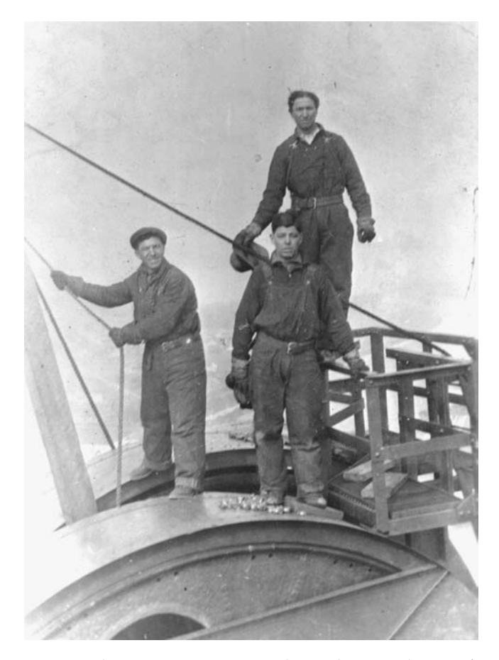
FIGURE 3. Rotinonhsionni (Iroquois) travel into the United States from Canada became more difficult after the passage of the Immigration Act of 1924, a change that threatened the economic livelihood of Mohawk ironworkers from Kahnawake.

southern and eastern Europe.<sup>17</sup> The national origins quota system that was the centerpiece of the 1924 act was not aimed specifically at native people from Canada, but it did have important consequences for them. Added to passport requirements that were instituted in 1918, the commitment of the American government to tighten border controls and