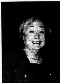
Monica McWilliams, co-chair, NIWC