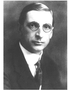
Eamon de Valera