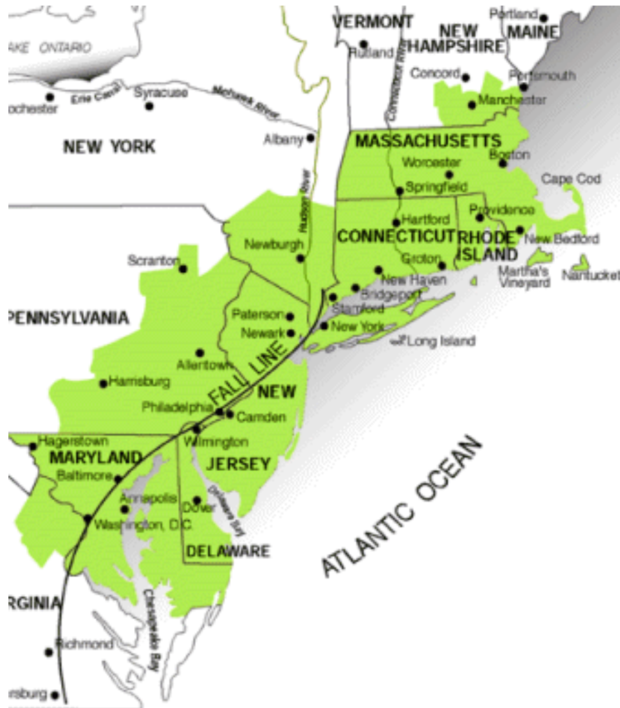
Figure 2. The American Megalopolis (About the USA, 2012)

Manhattan Country School (MCS) and Snipes Farm & Education Center are working to help residents and students maintain or uncover their relationship with the land. Founded in 1966, MCS is partnered with a 180-acre working farm located in the Catskills region of New York State; students visit the farm at least once per semester, and graduating 8 th -grade students are required to complete a variety of farm activities. Students are also exposed to concepts of civic engagement, social justice, and social activism, and are expected “to champion excellence and justice, compassion and peace, and the rights of all people to racial, economic, environmental, and educational equity” (Manhattan Country School, 2010). MCS seeks to help students in one of the most urban and human-altered areas on the planet maintain a relationship with nature.