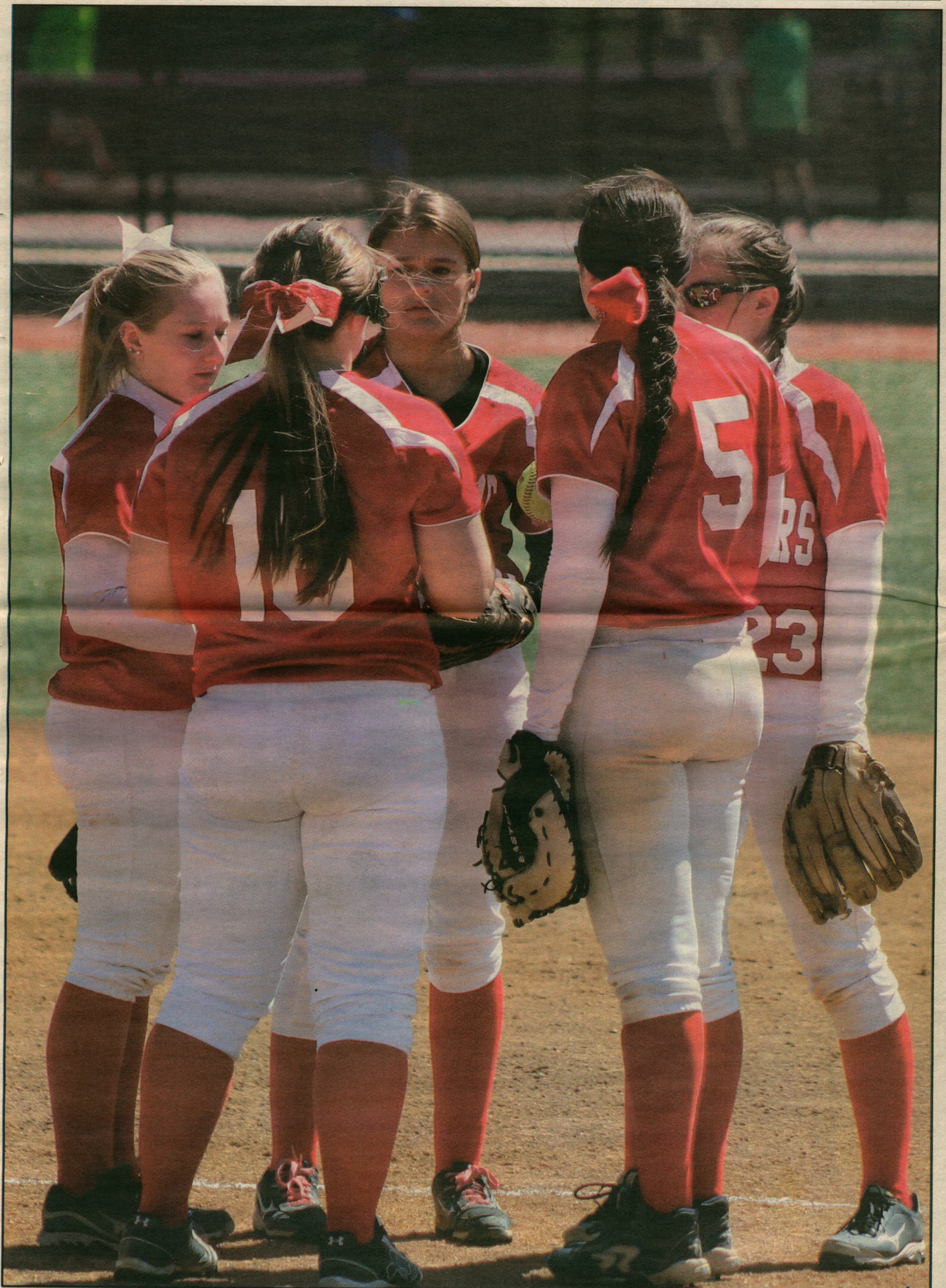
WOMEN'S CLUB SOFTBALL PLAYERS DISCUSS TACTICS DURING A GAME