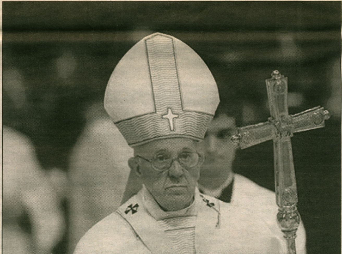
POPE FRANCIS LEAVES AFTER CELEBRATING MASS IN ST. PETER'S BASILICA AT THE VATICAN, SUNDAY, APRIL 17, 2016. POPE FRANCIS ORDAINED ELEVEN NEW PRIESTS SUNDAY.

He made note of the pressure the Church has placed on families as well, which has led to them feeling alienated and condemned.