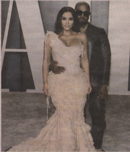
Kim Kardashian and Kanye West posing together at an event.