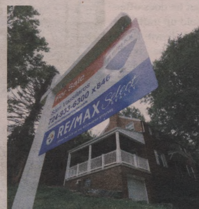
For Sale sign in front of house

"I've experienced living both on-campus and off-campus at Sacred Heart and I've found that there are benefits to both options, but I personally think having your own house can be a much more fun choice," said Hefferman. "Living off-campus not only gives you more freedom, but helps a person develop the required life skills that are necessary for growing up."