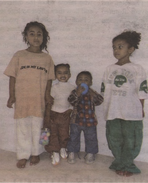
Kim Kardashian's and Kanye West's children from left to right North, Chicago, Psalm, and Saint.