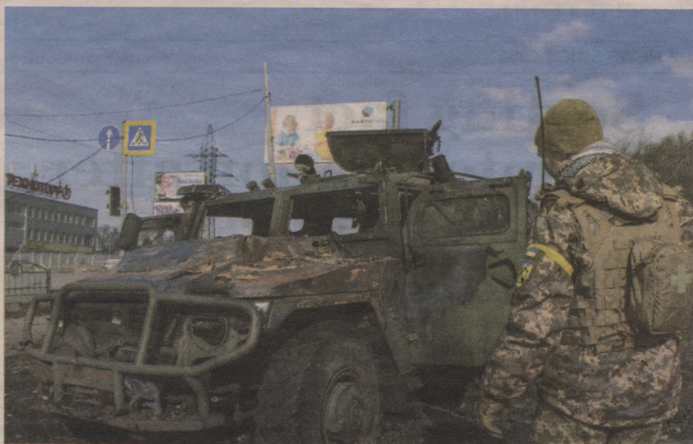
A Ukrainian soldier inspects a damaged military vehicle after fighting in Kharkiv, Ukraine, Sunday, Feb. 27, 2022.