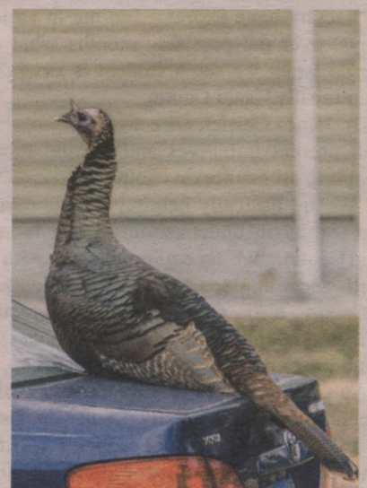
The Turkey has also been spotted sitting on top of cars.

"Give the turkey space, and do not chase it while the Connecticut Department of Energy and Environmental Protection considers options," said MacNamara.