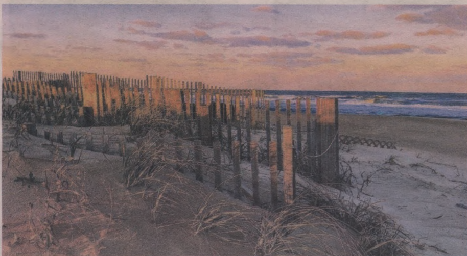
Outer Banks, South Carolina is a great place to travel to for Spring Break.

What are your plans for spring break this year? After not having a break last year, plenty of students decided to make plans for this break whether it be a trip or spend quality time with friends and family.