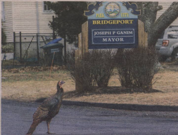
The infamous Martire Turkey standing in the middle of Park Ave.

Although the turkey has been a problem for several students, many find it to be humorous. An Instagram page has been created that