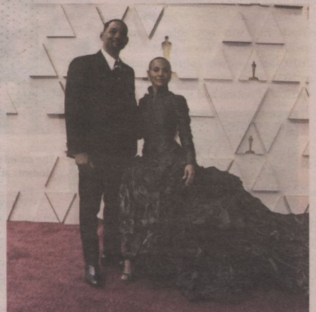
Will Smith and Jada Pinkett Smith posing on the red carpet before the Oscars begin.