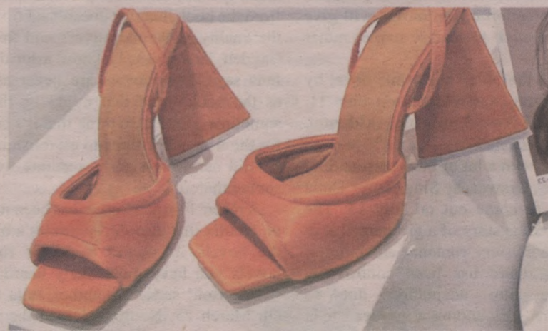
Bright orange heels from Etsy

"I didn't even notice it, but I have been seeing higher heels on the runway recently.