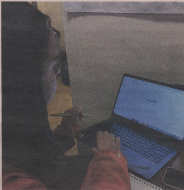
SHU student logging into her LinkedIn account to display her resume, research jobs, and network.

There are several job search platforms such as Indeed, LinkedIn and Handshake that students utilize to search for jobs. These tools allow students to make connections with employees, advertise their skills on their profiles and search through occupations that