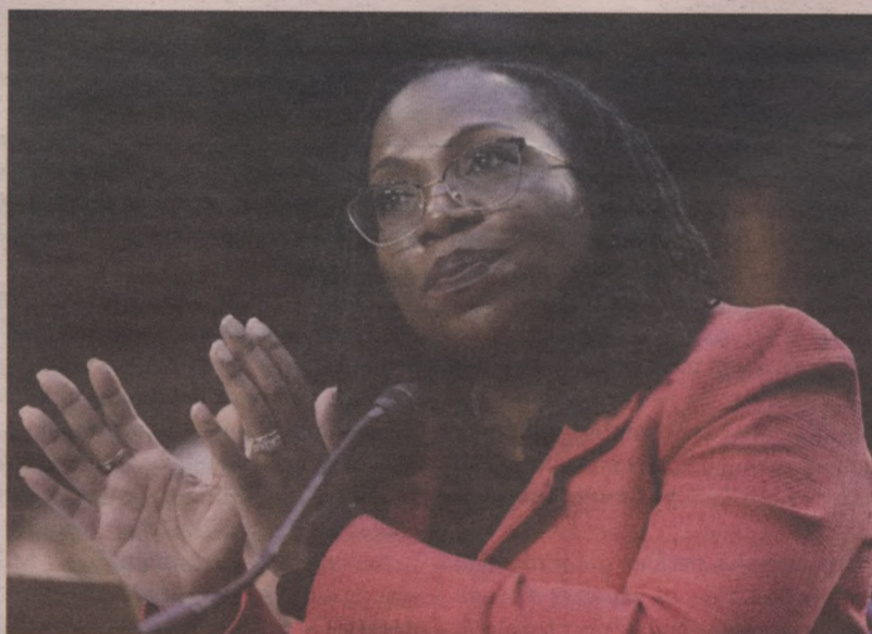
Judge Ketanji Brown Jackson at her court hearing.

"So Jackson's selection by President Biden can be viewed as a continuation of Presidents demonstrating sensitivity to inclusivity and sensitivity to the voices of demographic groups once on the margins of American society, not to mention how such appointments also reflect very wise political considerations," he said.