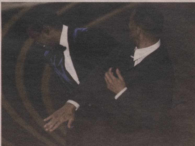
The moment Will Smith slapped Chris Rock on stage during the Oscars.

According to an article by AP News, "[Will] Smith left millions of witnesses stunned