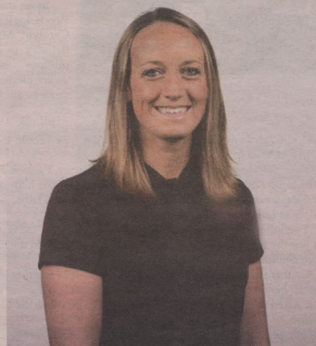
Sacred Heart University