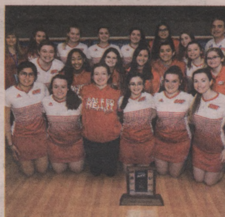
The Women's Bowling Team worked very hard for the NEC Champion Title.

inception back in 1993. Now, on top of leading her team to the NEC title, she was named NEC Coach of the Year for the fifth time.