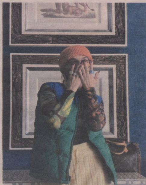
Instagram @emmachamberlain Emma Chamberlain posted this in March of last year