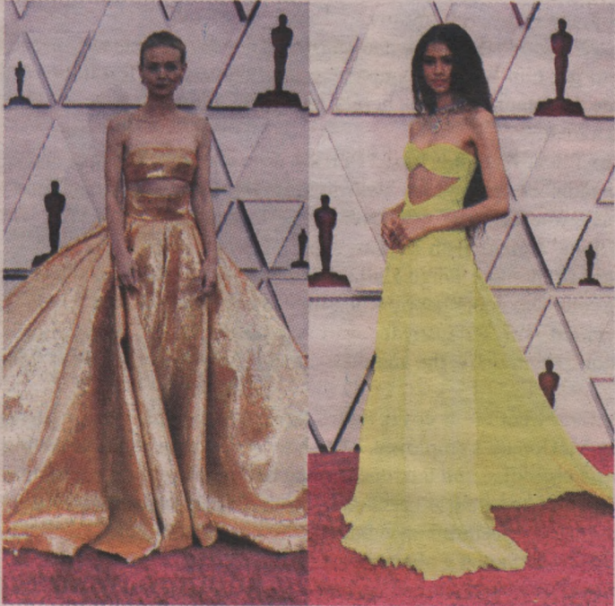
THE OSCARS ARE KNOWN FOR THEIR RED CARPET AND RED CARPET LOOKS. BUT WHO WERE THE STAND OUTS THIS YEAR?