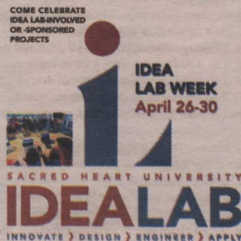
SACRED HEART UNIVERSITY