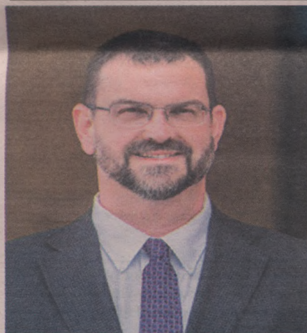
Sacred Heart University