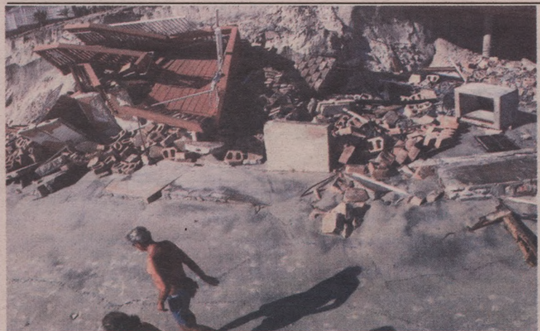
Beachgoers walk past a collapsed pool deck Monday, Oct. 3, 2022, in Daytona Beach Shores, Fla., as hotel and condo seawalls and decks along the Volusia County coastline were gutted by Hurricane Ian last week.

FORT MYERS, Fla. (AP) — Days after the skies cleared and the winds died down in Florida, Hurricane Ian's effects persisted Monday, as people faced another week without power and others were being rescued from homes inundated with lingering floodwaters.