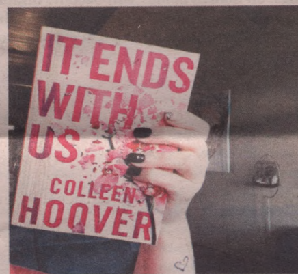
Colleen Hoover holds one of her most popular books.

TikTok, the global social media platform that is known for trafficking in short videos, is home to many viral trends. Dance, comedy and aesthetic videos are categories that make