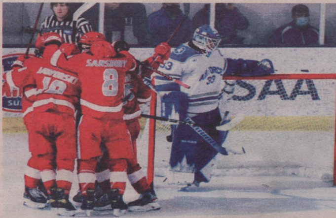
The Pioneers season will open with a game at Providence College on Friday, Oct. 7th.

Sacred Heart Athletics contributed to this article.