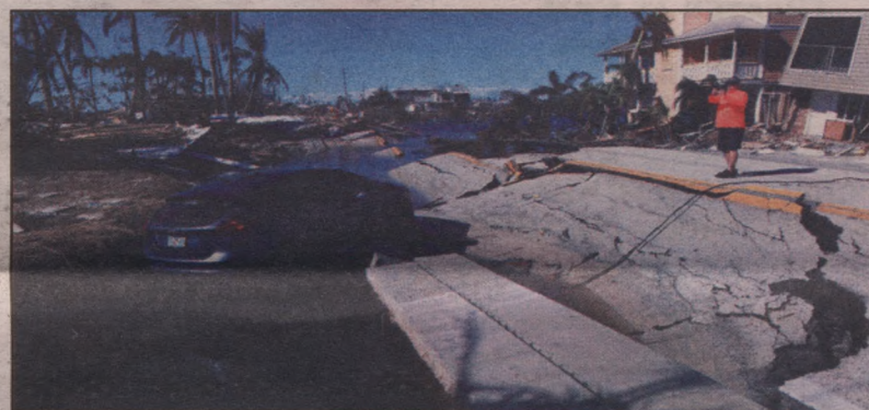
A man takes pictures of the destruction around the bridge leading to Pine Island, in the aftermath of Hurricane Ian in Matlacha, Fla., Sunday, Oct. 2, 2022. The only bridge to the island is heavily damaged so it can only be reached by boat or air.

After moving across Florida, Ian made another landfall in the U.S. in South Carolina as a much weaker hurricane. Officials said Monday that crews were finishing removing sand from coastal roads and nearly all power had been restored.