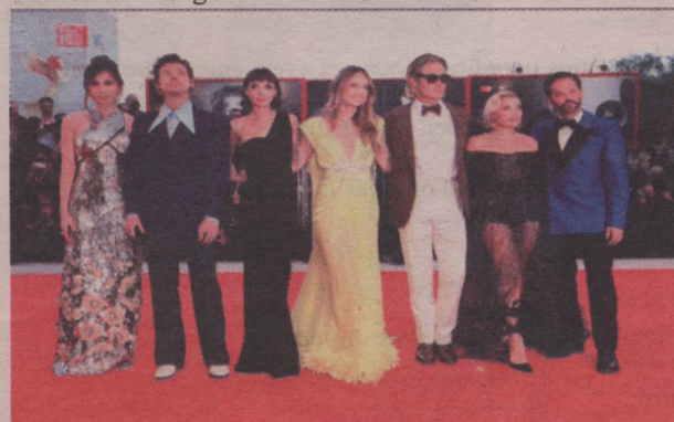
The cast of "Don't Worry Darling" on the red carpet at the Venice Film Festival.

"What are you willing to sacrifice in order to do what's right? Are you willing to dismantle the system that is designed to serve you? That's the world, and the question, of 'Don't Worry Darling,'" said Wilde in La Biennale Di Venezia.