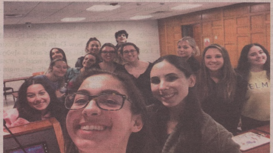
Sacred Heart University's Psychology club at one of their meetings.

Sacred Heart also has a counseling center for students who feel like they need to talk to someone about what is going on in their life. Students can make an appointment with a counselor by calling (203) 371-7955 or following the instructions on their website at https://www.sacredheart.edu/offices--departments-directory/counseling-center/appointments/ .