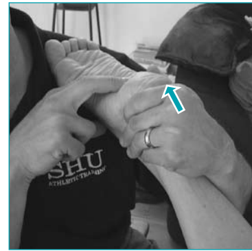
Figure 4 Plantar fascia. Patient is prone with knee flexed to \sim 60^\circ , dorsum of foot on athletic therapist's shoulder or knee, marked meta-tarsal and ankle plantar flexion, calcaneus compressed toward toes. Move calcaneus into varus and valgus for fine-tuning.