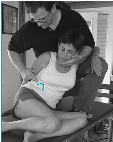
Figure 2 Intercostals. The patient is seated in side position and rests the arm on the uninvolved side on the athletic therapist's knee. Trunk is flexed toward tender-point side, rotation and flexion toward tender-point side, head is toward tender-point side or resting on athletic therapist's leg, arm on the uninvolved side hangs at side.