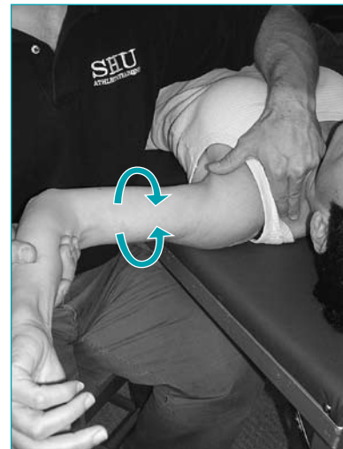
Figure 5 Trapezius. Patient is supine with head laterally flexed toward tender point, shoulder abducted to 90^\circ . Shoulder flexion or extension and rotation are used to fine-tune.